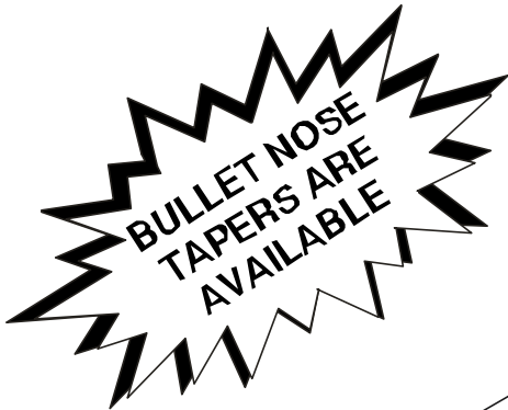
ITA MOUNT STYLE